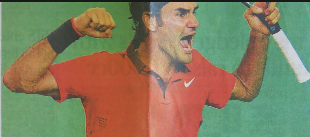
Roger Federer reacts after defeating Gilles Simon in the men's singles final at the Shanghai Masters in the Qizhong Tennis Stadium in Shanghai on Sunday. Federer won 7-6 (8/6), 7-6 (7/2).