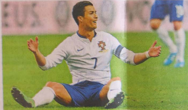
Portugal's Cristiano Ronaldo reacts during their friendly football match against France at the Stade de France in Saint-Denis, north of Paris, on Saturday. France won 2-1.